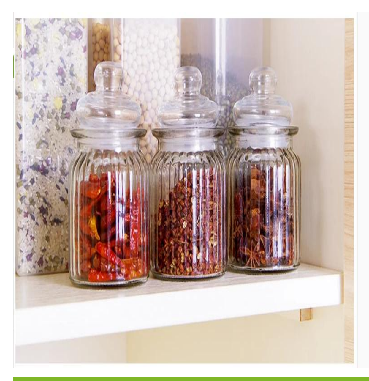
What are the glass storage containers applications?