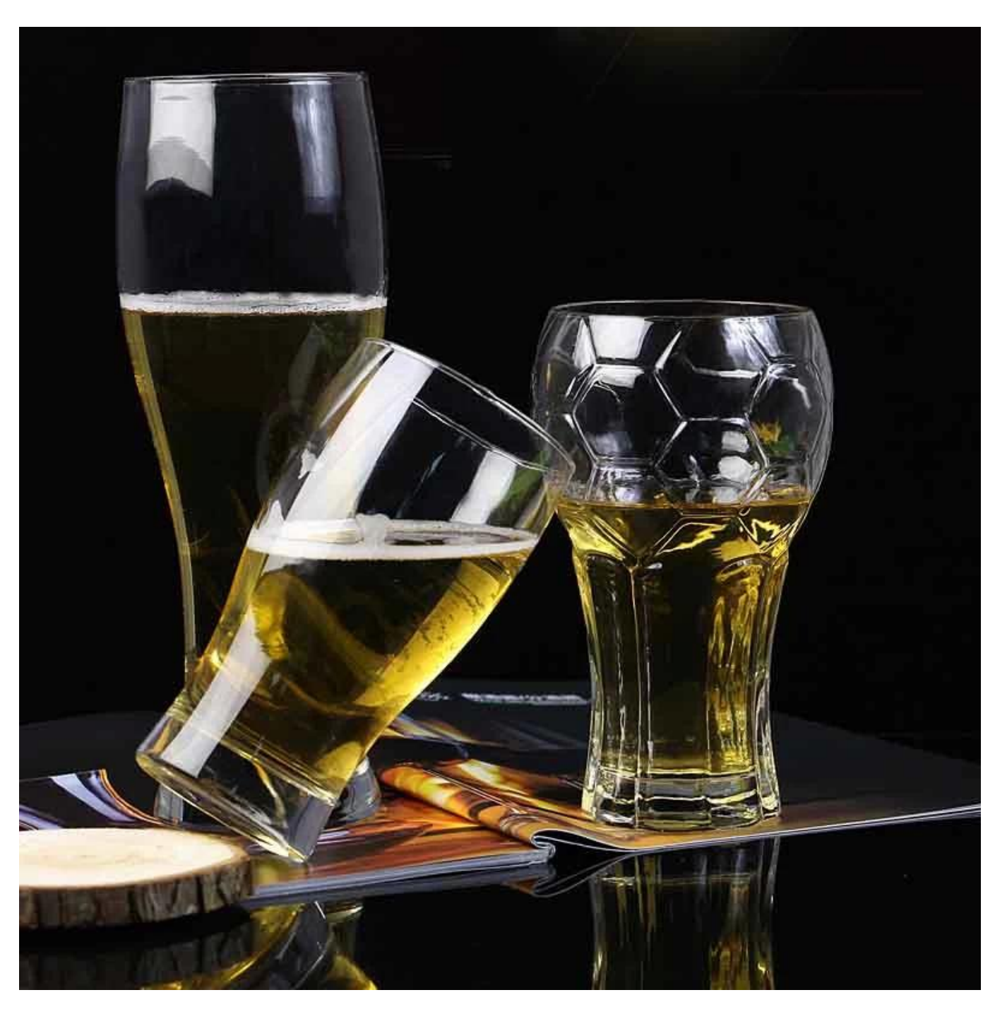
Who are we?