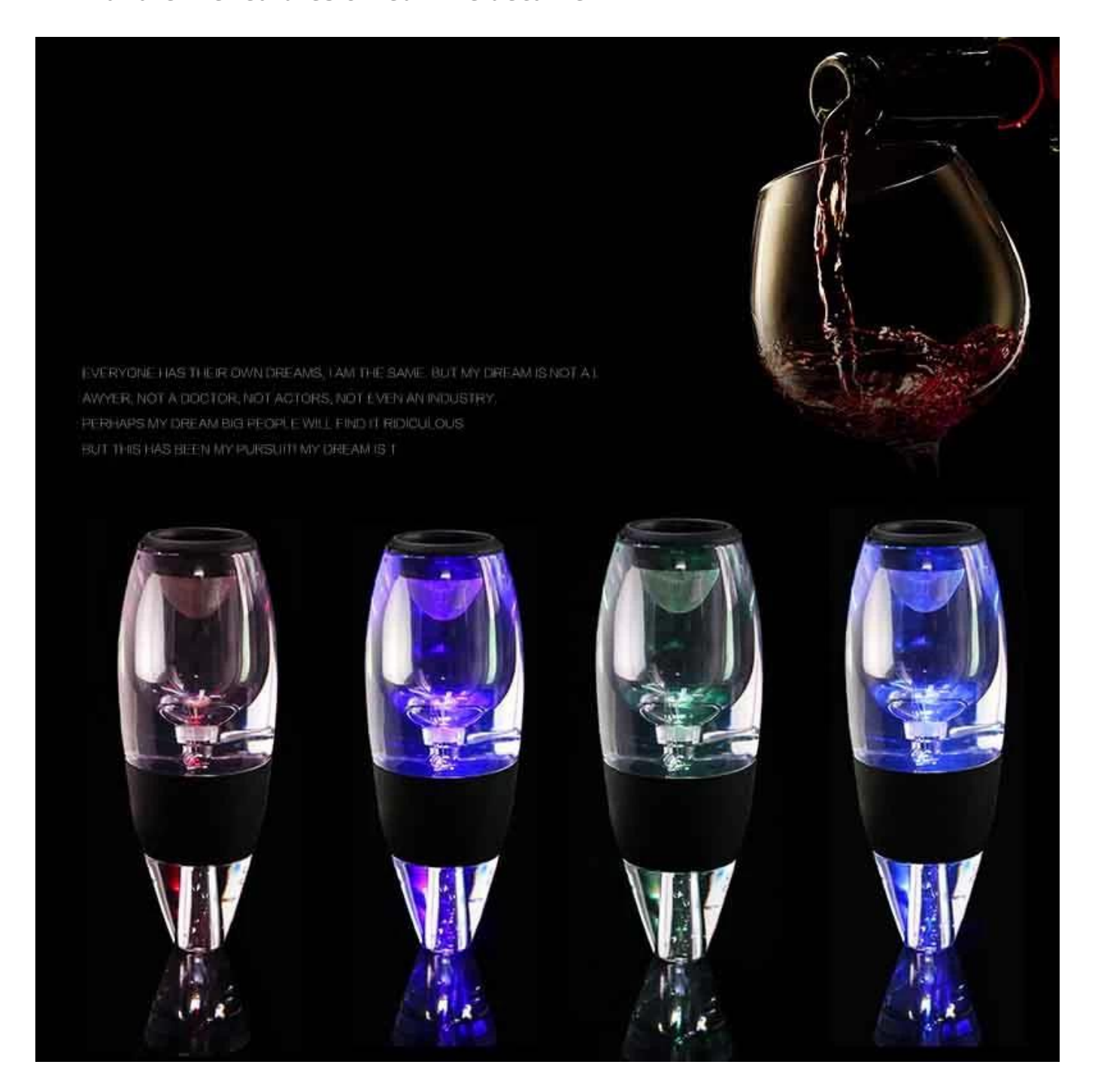
What are the functions of red wine decanter?

What are the features of red wine decanter?