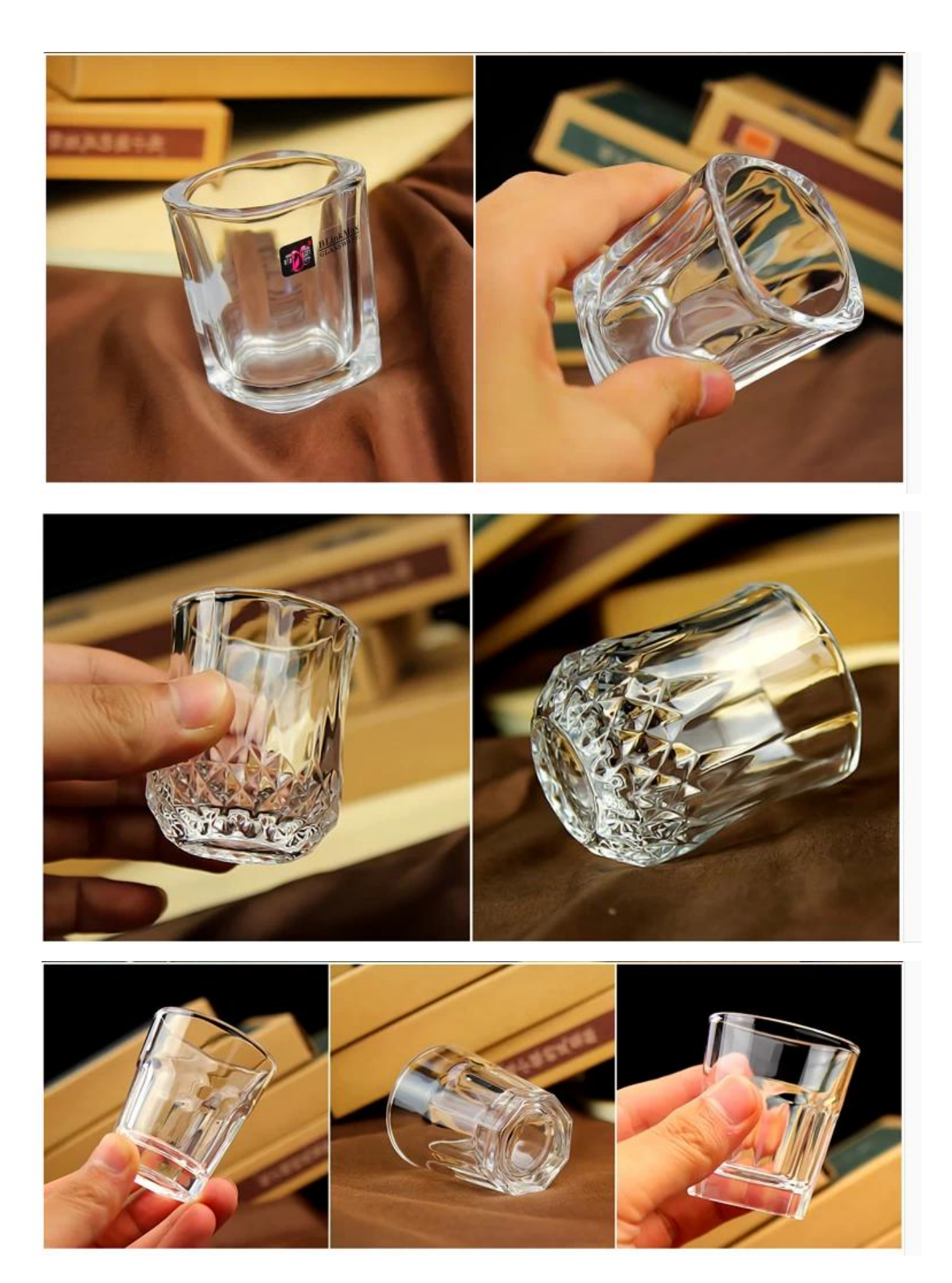
What are the customized shot glass applications?