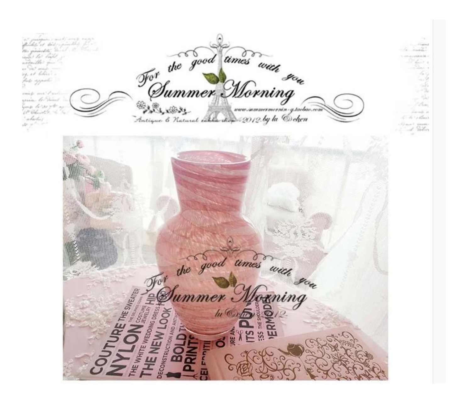
What are the colored glass vases applications?