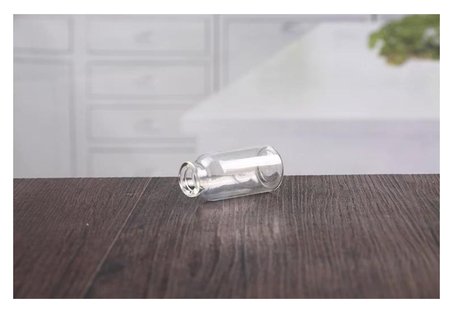
Who are we?