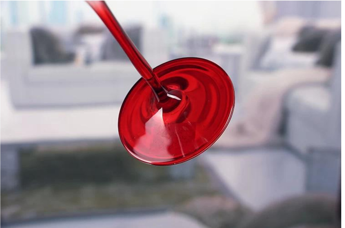
Spray color red stem wine glass