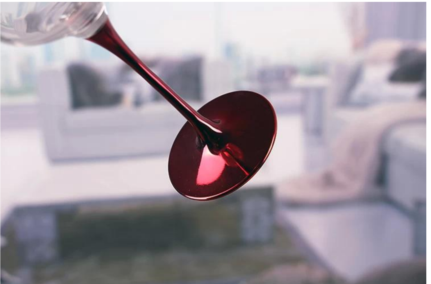
Electroplate red stem wine glasses