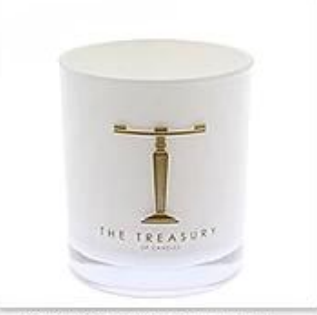
White Glass Candle Holder