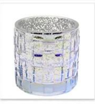
Glass Candle Holder with Hollow Plated and Colorful