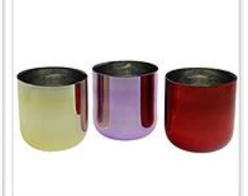
Plated and Painting Glass Candle Holder