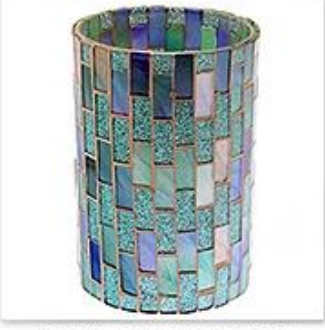
Mosaic Glass Candle Holder