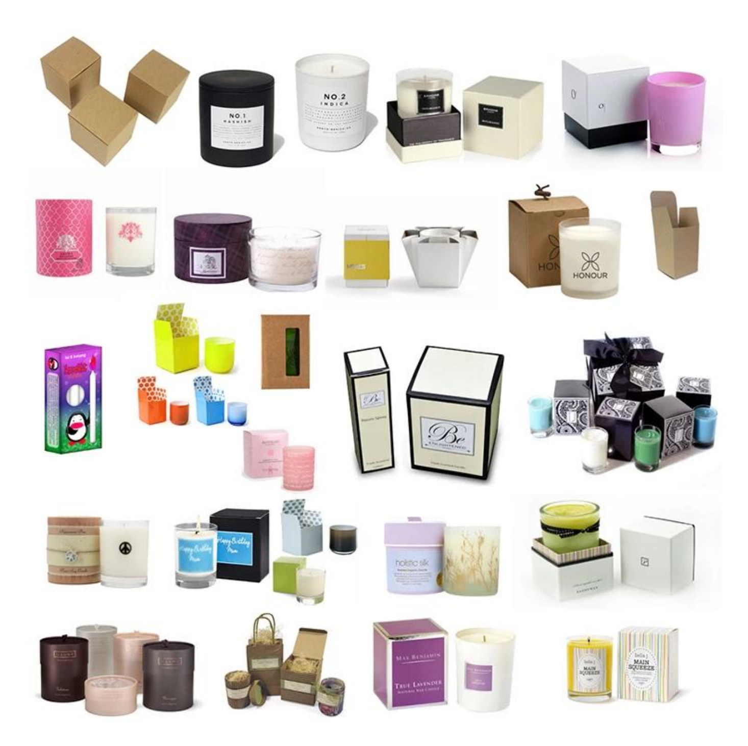
We are ready to serve you!