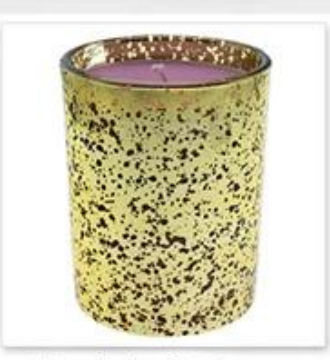
Hollow Golden Plated Glass Candle Holder