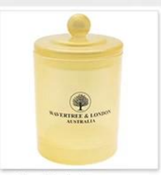
Glass Candle Jar