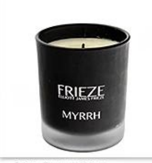
Black Frosted Glass Candle Holder