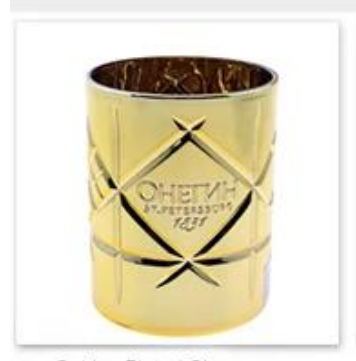
Golden Plated Glass Candle Holder