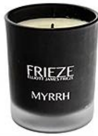
Black Frosted Glass Candle Holder