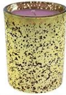
Hollow Golden Plated Glass Candle Holder