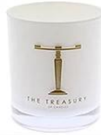
White Glass Candle Holder