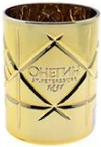
Golden Plated Glass Candle Holder