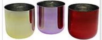
Plated and Painting Glass Candle Holder