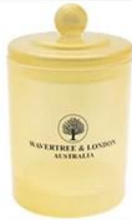
Glass Candle Jar