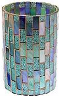
Mosaic Glass Candle Holder