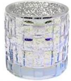
Glass Candle Holder with Hollow Plated and Colorful