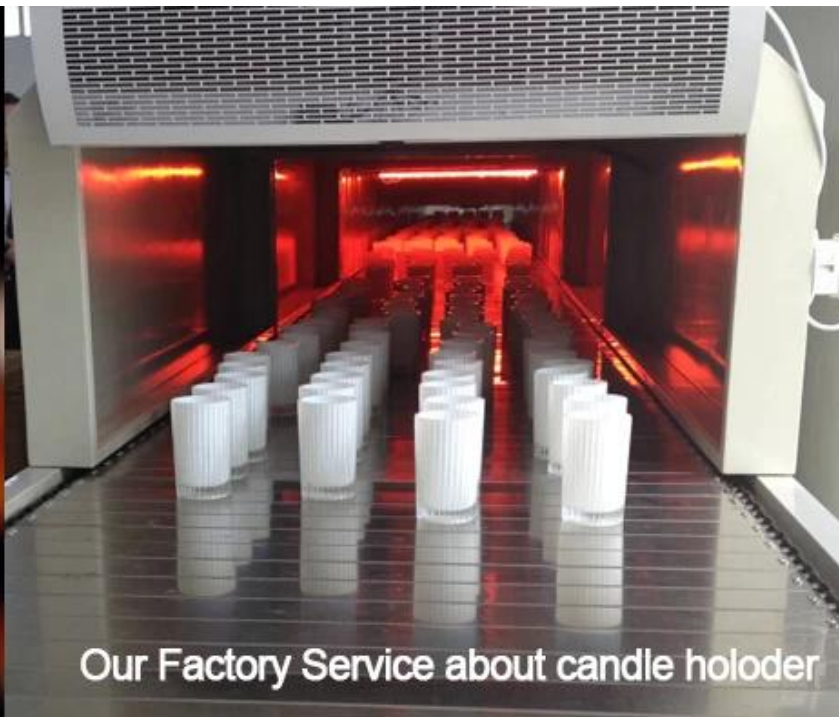
Our Factory Service about candle holder