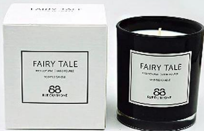
1. Candlestick Holder Diy photo