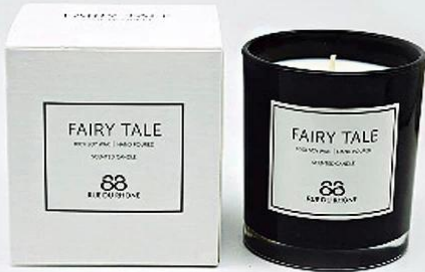
1. Candlestick Holder Diy photo