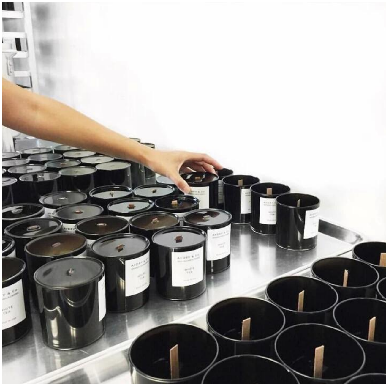
2. Candlestick Holder Diy photo