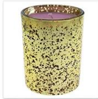
Hollow Golden Plated Glass Candle Holder