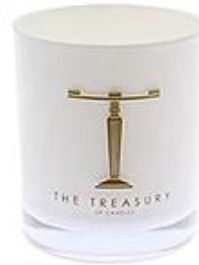
White Glass Candle Holder