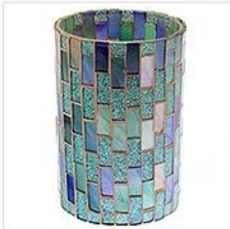
Mosaic Glass Candle Holder