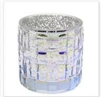
Glass Candle Holder with Hollow Plated and Colorful