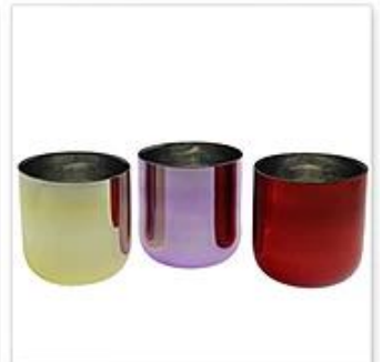
Plated and Painting Glass Candle Holder