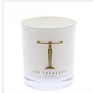
White Glass Candle Holder