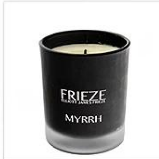
Black Frosted Glass Candle Holder