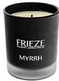
Black Frosted Glass Candle Holder