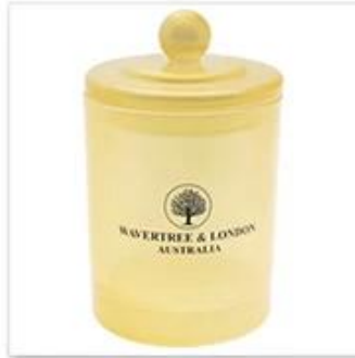
Glass Candle Jar