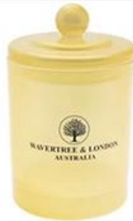
Glass Candle Jar