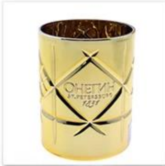
Golden Plated Glass Candle Holder