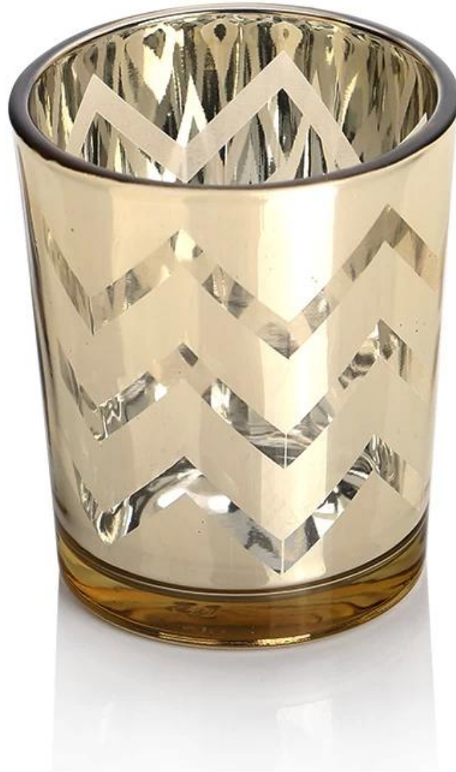
Votive Candle Holder Photos: