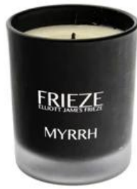
Black Frosted Glass Candle Holder