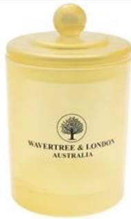
Glass Candle Jar