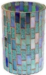
Mosaic Glass Candle Holder