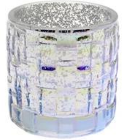
Glass Candle Holder with Hollow Plated and Colorful