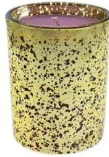
Hollow Golden Plated Glass Candle Holder