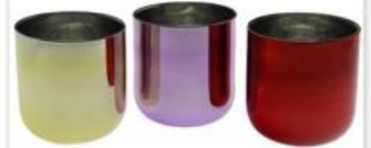
Plated and Painting Glass Candle Holder