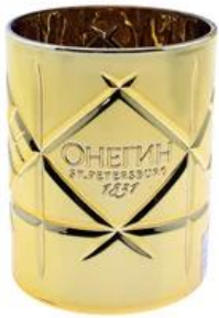
Golden Plated Glass Candle Holder