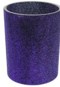
Purple Glitter Powder Glass Candle Holder