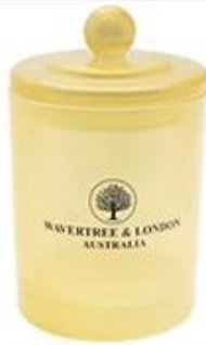
Glass Candle Jar