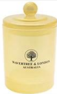
Glass Candle Jar