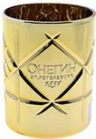
Golden Plated Glass Candle Holder