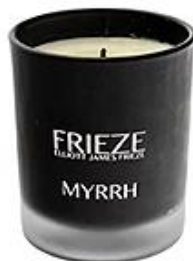
Black Frosted Glass Candle Holder