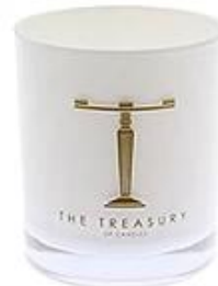
White Glass Candle Holder