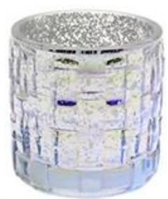
Glass Candle Holder with Hollow Plated and Colorful