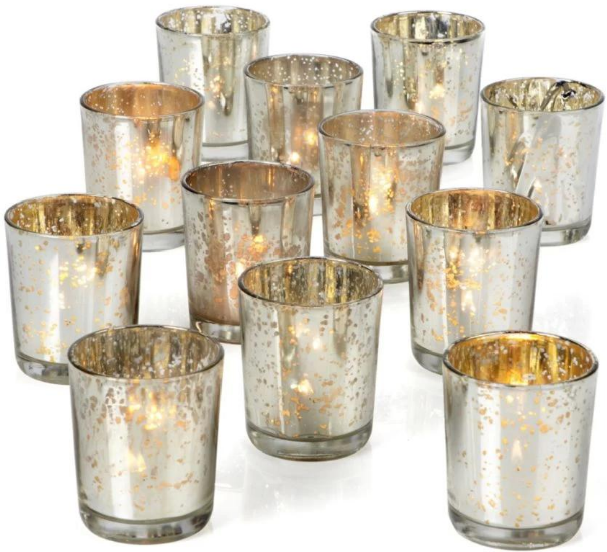
CD005 New Hot High Quality Large Capacity High White Glass Decorative Candle Holder For Banquets