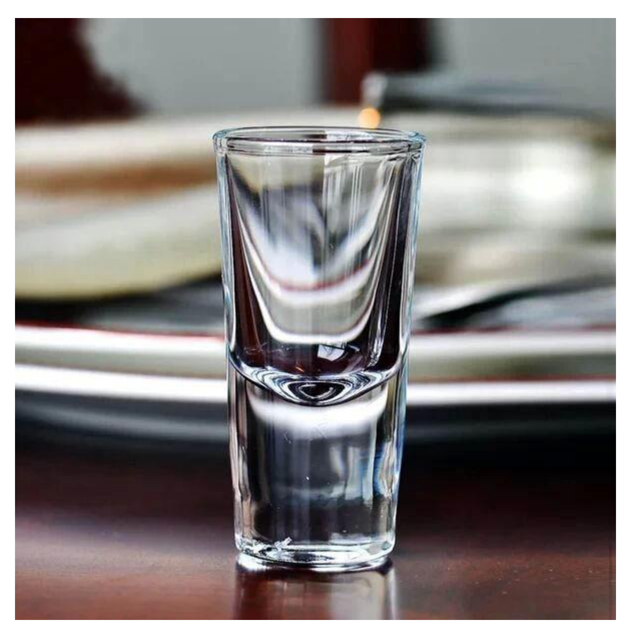
What are the shot glass applications?