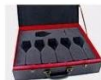
N. Gift Box