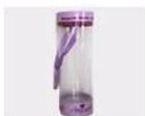
M. Pvc Box