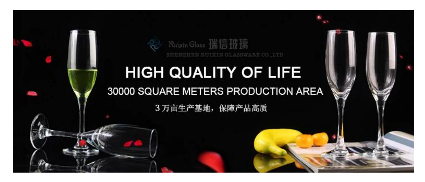
What are the features of birthday painted wine glasses?