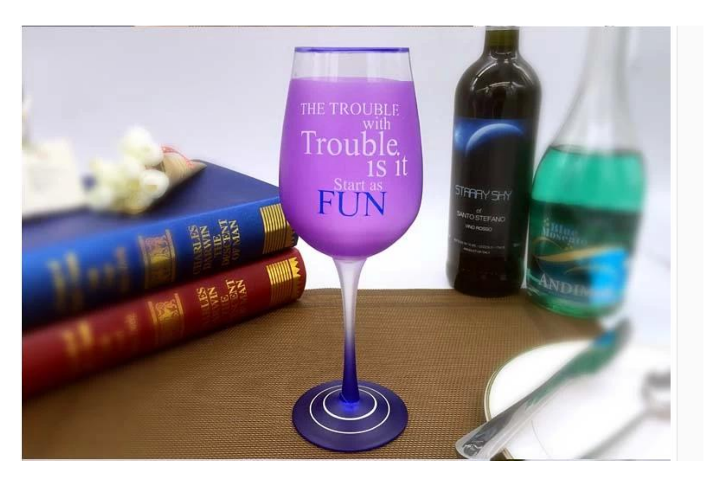
What are the birthday painted wine glasses applications?