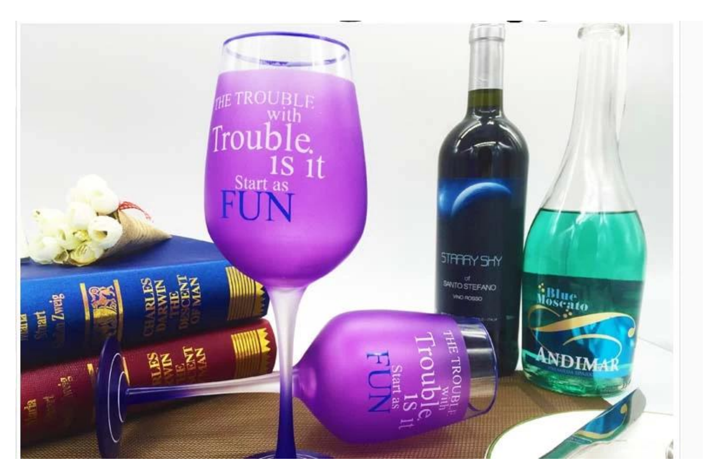
What are the functions of birthday painted wine glasses?