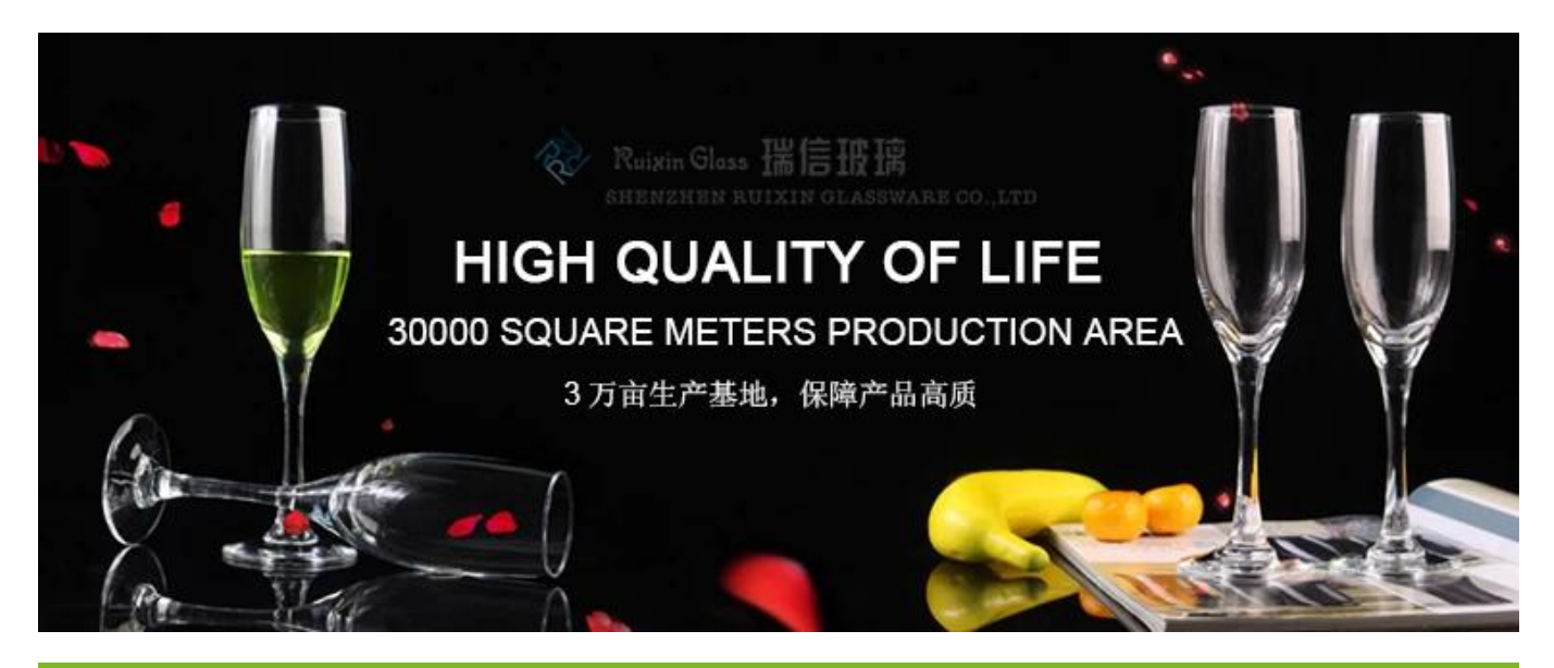
What are the features of glass beer mugs?