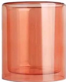
RXCD-10A1901-M Size: Ø10.1cm*H11.5cm Capacity: 485ml/12oz. Weight: 287.5g