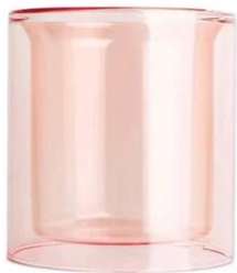
RXCD-10A1901-S Size: Ø9.1cm*H9.9cm Capacity: 325ml/8oz. Weight: 227.5g