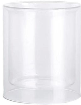
RXCD-10A1901-L Size: Ø11.1cm*H12.6cm Capacity: 645ml/16oz Weight: 337.3g