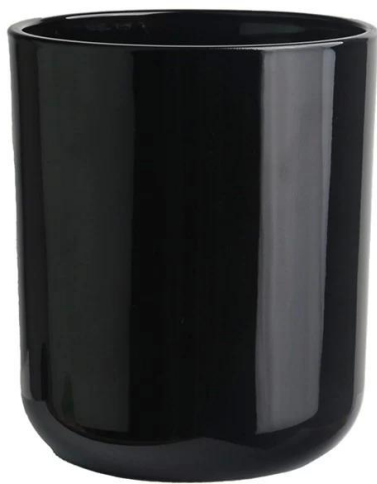
RXCD-8090U-GB Size: T8*B7.6*H9cm Capacity: 315ml./8oz. Weight: 250g