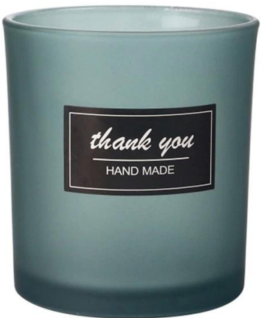
RXCD-8090-FC Size: T8.1*B7.6*H9.1cm Capacity: 315ml./8oz. Weight: 250g