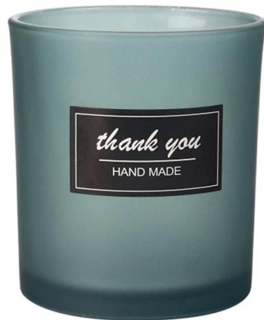
RXCD-8090-FC Size: T8.1*B7.6*H9.1cm Capacity: 315ml./8oz. Weight: 250g