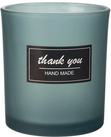
RXCD-8090-FC Size: T8.1*B7.6*H9.1cm Capacity: 315ml./8oz. Weight: 250g