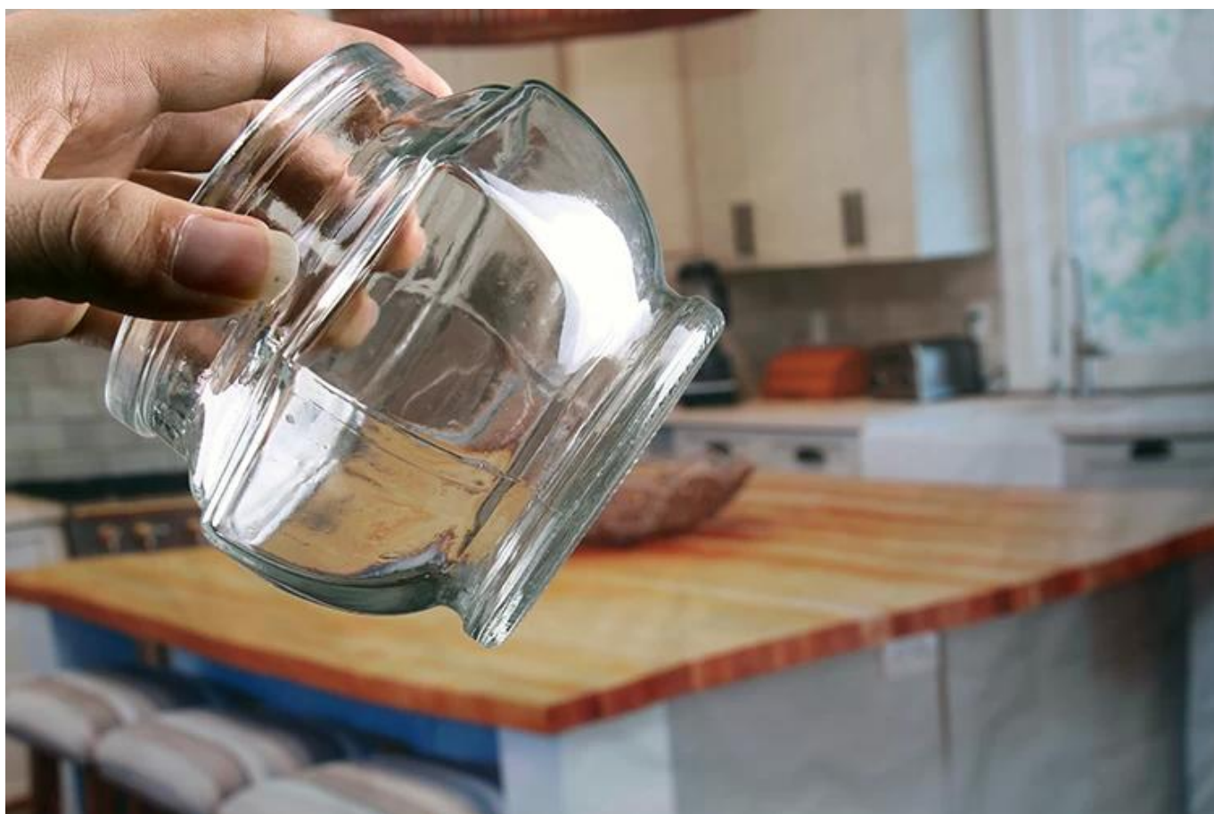
Octagon glass storage jars