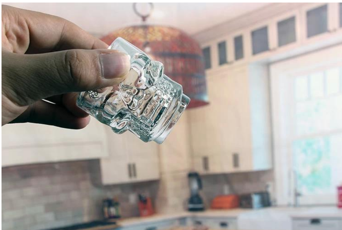
Bar skull shot glass