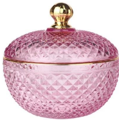
RXHY-10910-S Size: D8.8*W4.3*H8.5cm Capacity: 165ml Weight: 264g