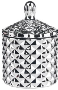
RXHY-11579 Size: D6.5*W6.5*H10cm Capacity: 115ml Weight: 205g