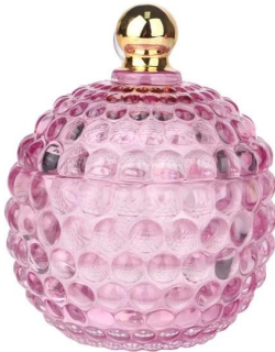
RXHY-15810-S Size: D8.5*H11cm Capacity: 140ml Weight: 350g