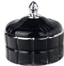
RXSHY-13161 Size: D10.4*W10*H10.3cm Capacity: 250ml Weight: 430g