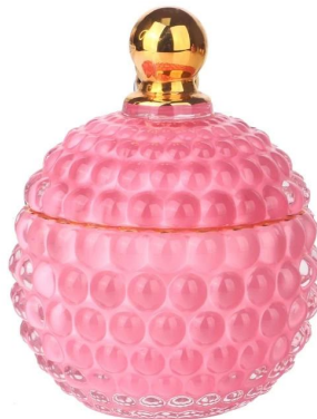
RXHY-15810-L Size: D10.5*W6.3*H14cm Capacity: 320ml Weight: 650g