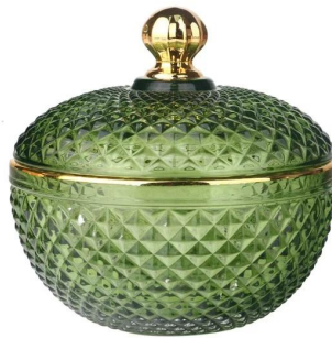
RXHY-10910-L Size: D12*W5.4*H12cm Capacity: 400ml Weight: 538g