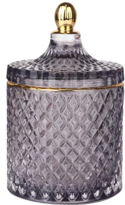
RXHY-8550-L Size: D10.5*W10.5*H17.5cm Capacity: 615ml Weight: 825g