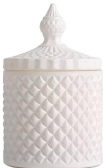
RXS515-M Size: D8.5*W8.5*H13.5cm Capacity: 300ml Weight: 460g