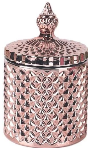
RXS515-S Size: D6.7*W6.7*H11.2cm Capacity: 140ml Weight: 239g