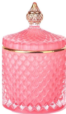
RXS515-L Size: D10.6*W10.6*H17.5cm Capacity: 600ml Weight: 770g