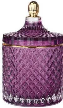
RXHY-8550-M Size: D8.6*W8.6*H13cm Capacity: 296ml Weight: 453g