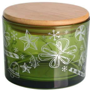
RXCD11080 Size: T11*B10.2*H8cm Capacity: 530ml/13.5oz Weight: 410g