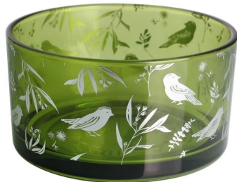
RXCD15080 Size: T15*B14.2*H8cm Capacity: 930ml/23.6oz Weight: 727g