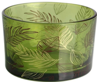
RXCD13080 Size: T13*B12.2*H8cm Capacity: 730ml/18.5oz Weight: 556g