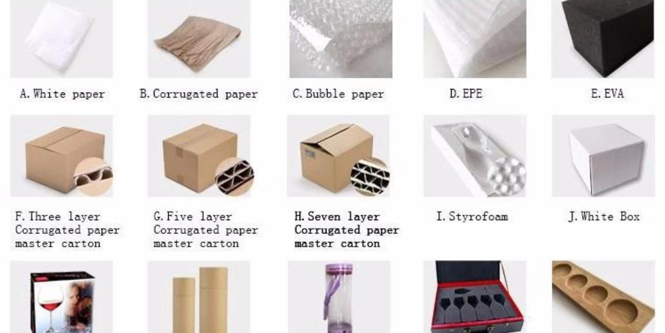
K. Color Box