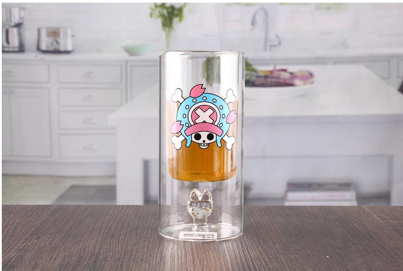
Personalised Glass Double Wall Tumbler