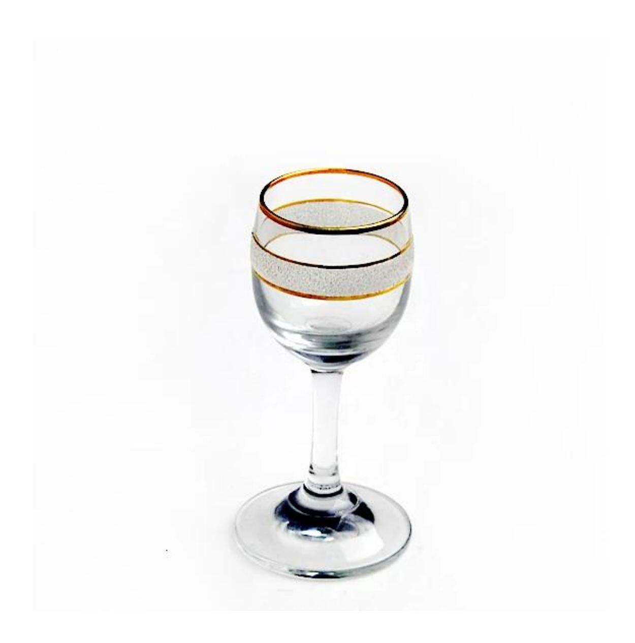
What are the small glasses applications?