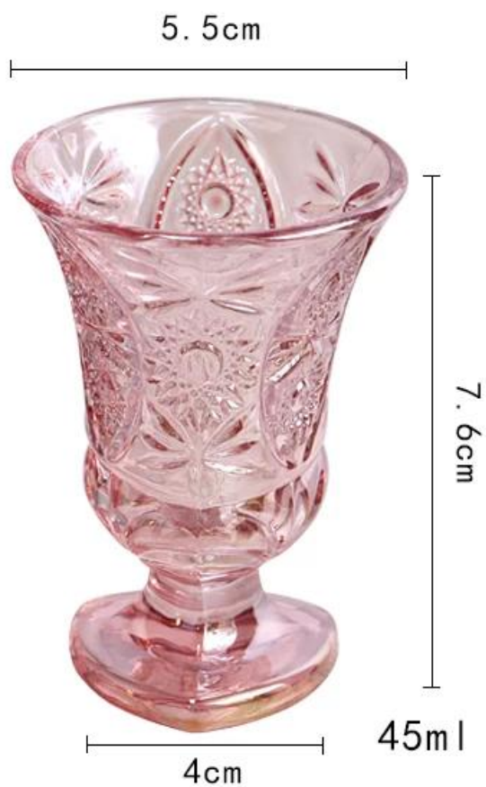
Pink love goblets