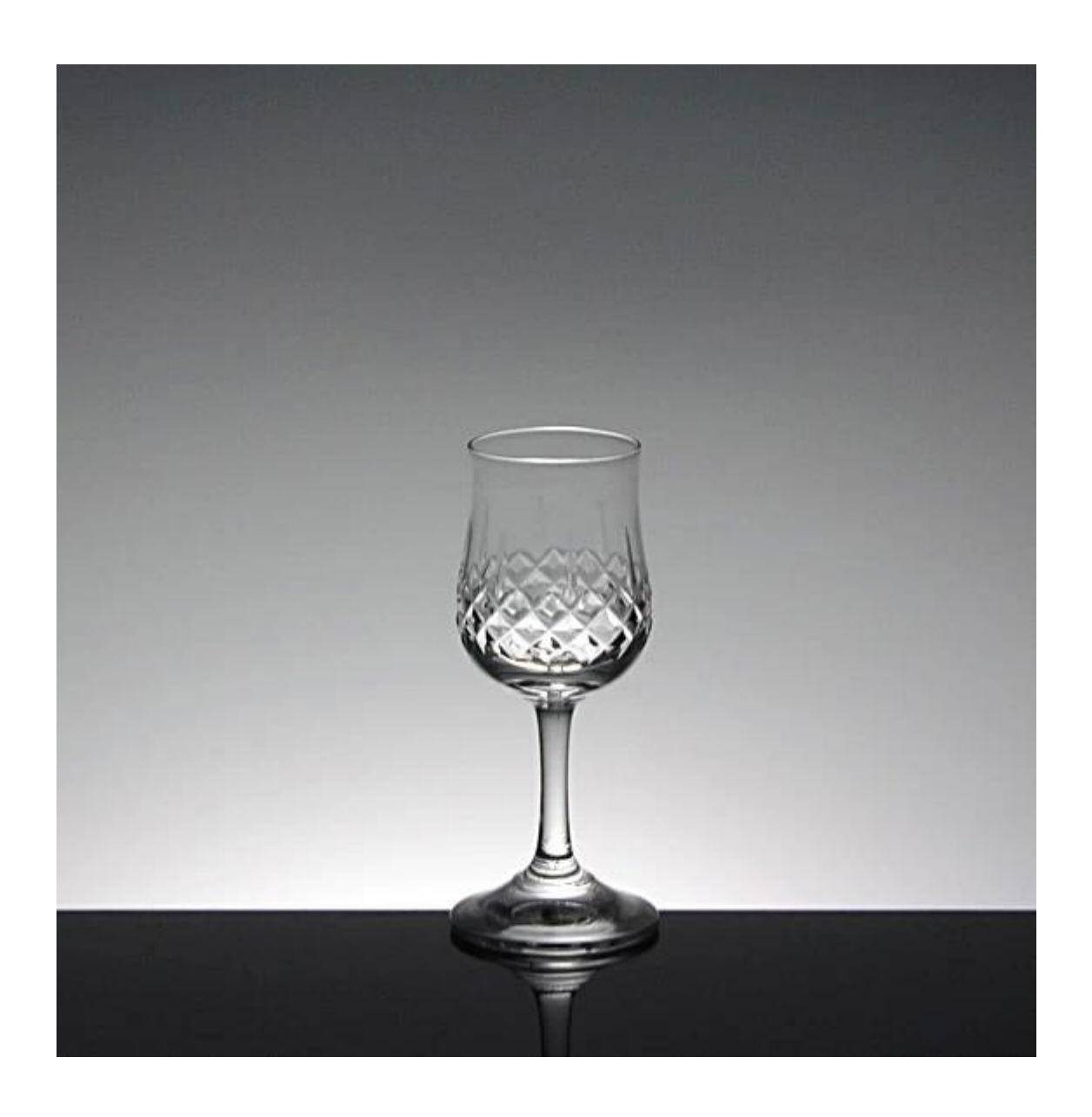
What are the small glasses applications?