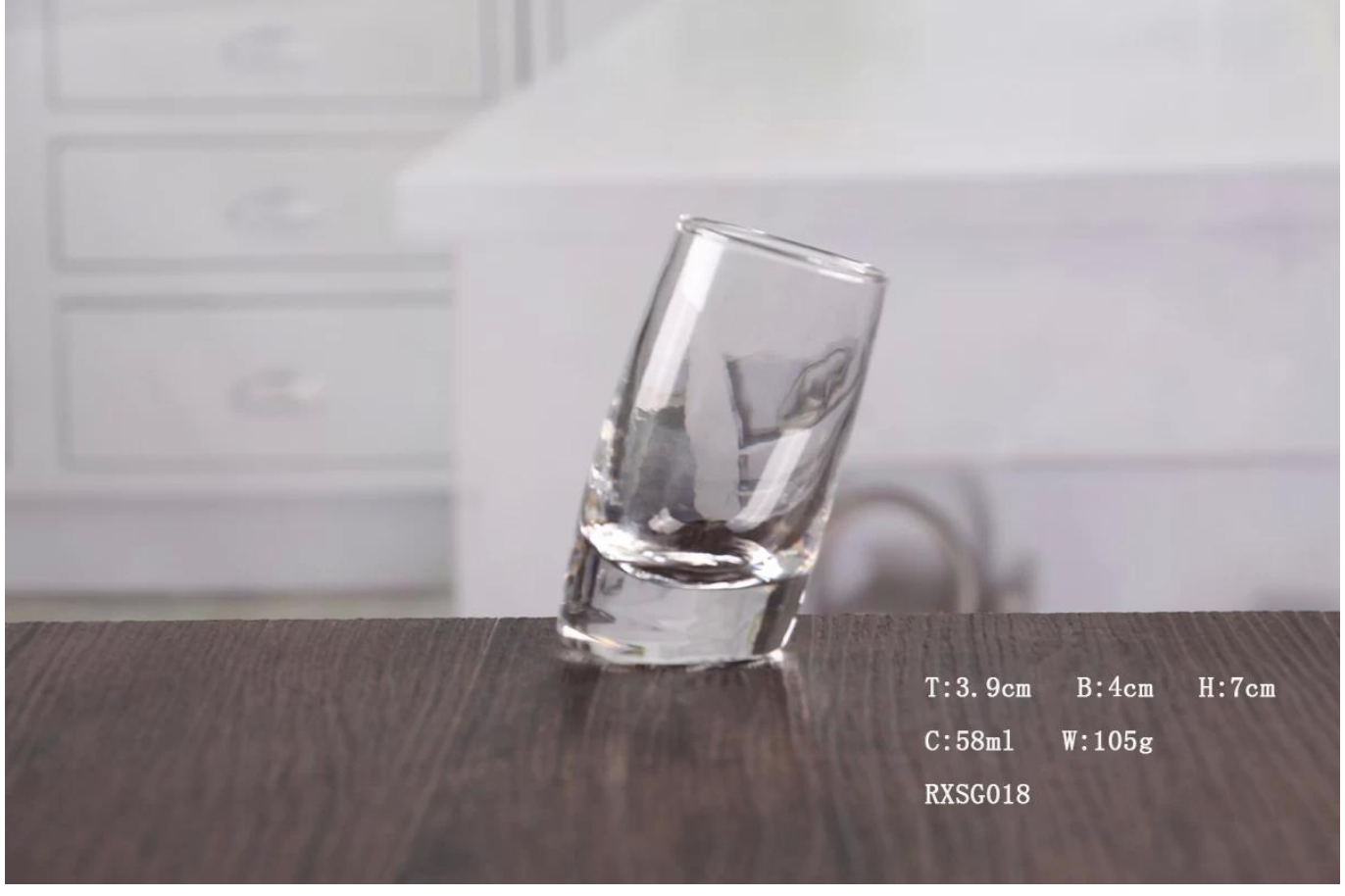
2 oz 60ML oblique bottom clear shot glasses customized wholesale