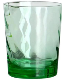
RXXZ2687 Size: T8.3*B6.8*H10cm Capacity: 336ml Weight: 239g