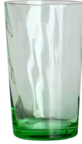
RXXZ2789 Size: T8*B6.5*H13.5cm Capacity: 455ml Weight: 225g