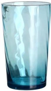
RXXZ2799 Size: T8.3*B6.5*H14.1cm Capacity: 500ml Weight: 208g