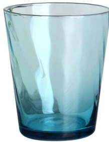
RXXZ2697 Size: T8.5*B6.9*H10.1cm Capacity: 335ml Weight: 144g