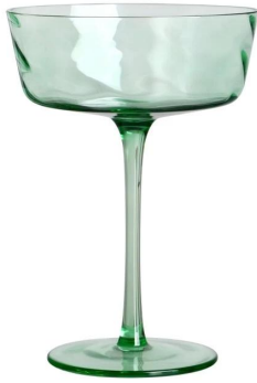
RXXZ1416 Size: T11.2*B7.8*H16.1cm Capacity: 310ml Weight: 183g