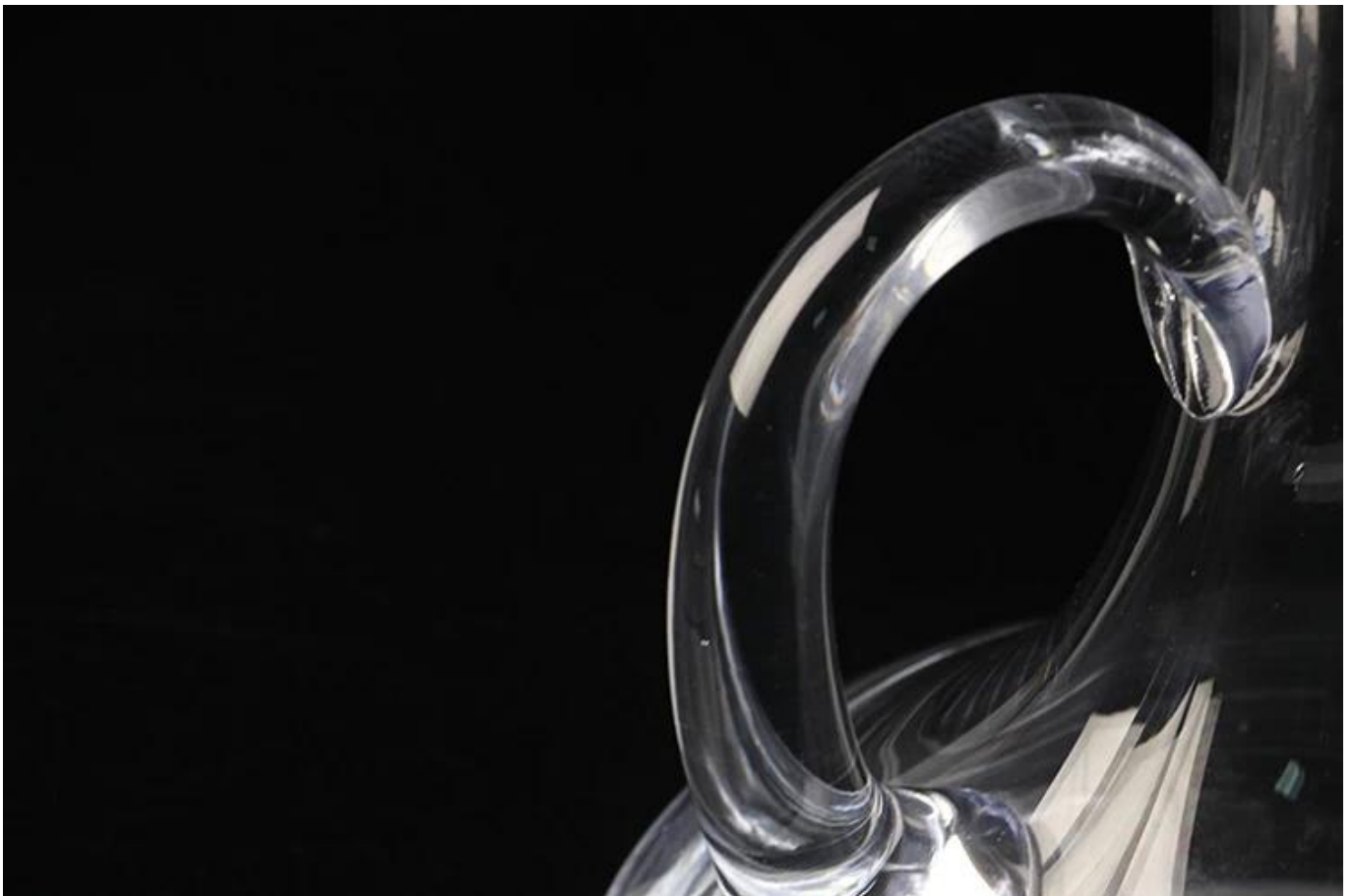
Crystal Wine Decanter With Handle