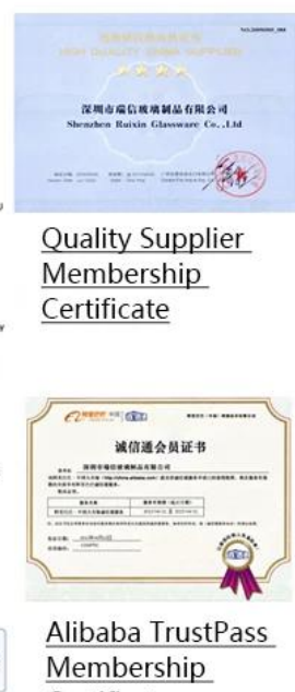
Alibaba TrustPass Membership Certificate