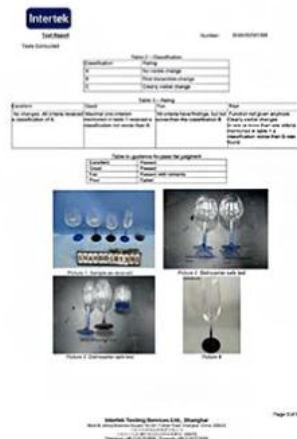
Spray glass cup dishwasher test report