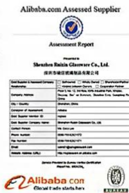
BV Verify factory