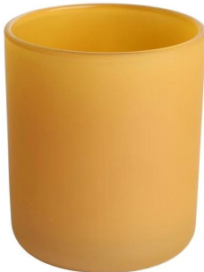
RXCD2404M08-R Size: T8.6*B8.4*H10cm Capacity: 359.1ml Weight: 385.7g