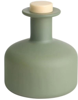
RXDB2404M01 Size: T4.9*B1.0*H10cm Capacity: 300ml Weight: 257.3g