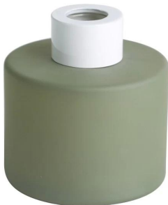
RXDB2404M06-S Size: T2.3*B7*H7cm Capacity: 136ml Weight: 181.2g