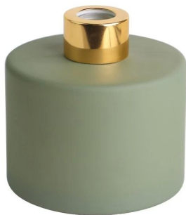
RXDB2404M06-L Size: T2.5*B8.5*H8.3cm Capacity: 230ml Weight: 299g