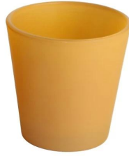
RXCD2404M07-S Size: T6.4*B4.4*H6.4cm Capacity: 101.8ml Weight: 102.5g