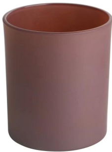
RXCD2404M08 Size: T9*B8.9*H10.2cm Capacity: 429.3ml Weight: 353.9g