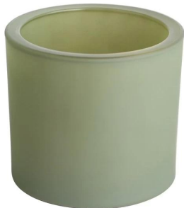
RXCD2404M08-S Size: T8.9*B8.4*H8cm Capacity: 273.1ml Weight: 439.3g