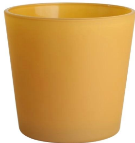
RXCD2404M07-L Size: T13.4*B10.3*H12.5cm Capacity: 1024.9ml Weight: 726.2g