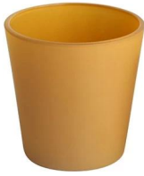
RXCD2404M07-M Size: T7.1*H5.4*H7.6cm Capacity: 180.8ml Weight: 151.3g