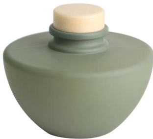
RXDB2404M02 Size: T3.3*B8.7*H6cm Capacity: 145ml Weight: 156.7g