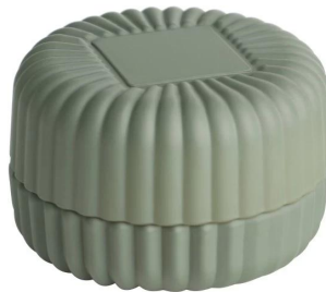
RXCD2404M09 Size: D8.4*H5.3cm Capacity: 100ml Weight: 311.8/201.9g