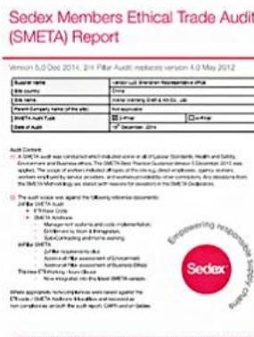
Sedex Verify factory certificate