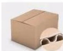
F. Three layer Corrugated paper master carton