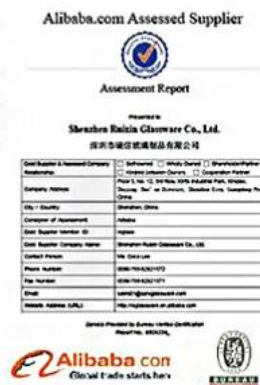
BV Verify factory