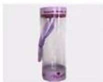
M. Pvc Box