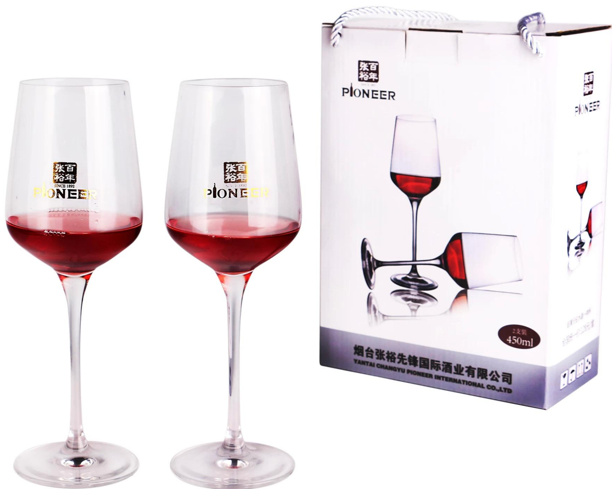
06 Custom Wine Glasses No Minimum