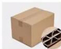
G. Five layer Corrugated paper master carton