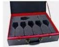
N. Gift Box