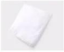
A. White paper