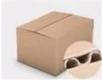
F. Three layer Corrugated paper master carton