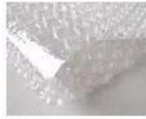
C. Bubble paper