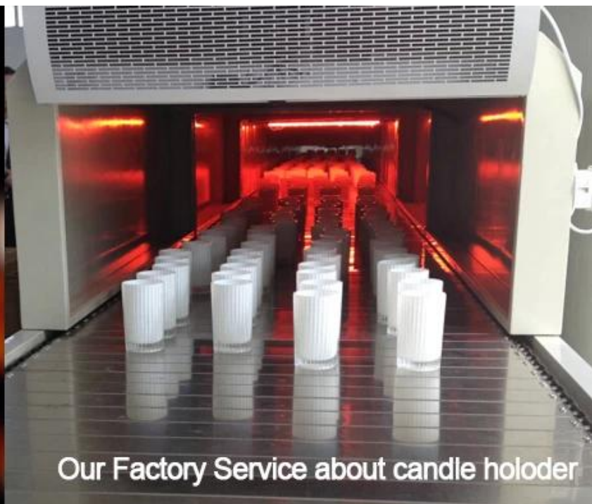
Our Factory Service about candle holder