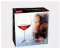
K. Color Box