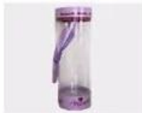
M. Pvc Box