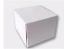
J. White Box