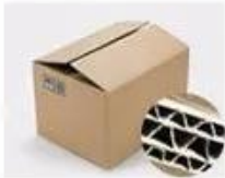
H. Seven layer Corrugated paper master carton