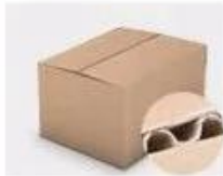
F. Three layer Corrugated paper master carton