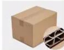
G. Five layer Corrugated paper master carton