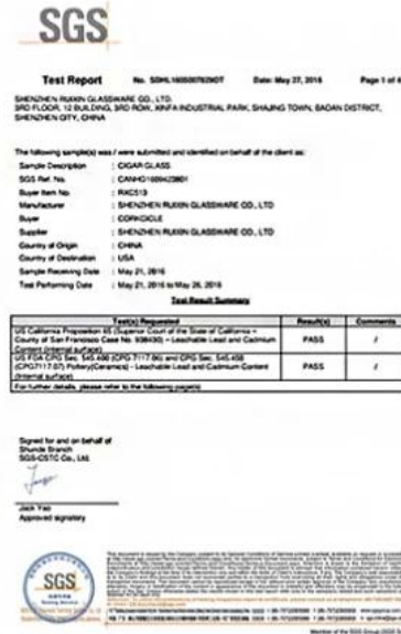
California 65 Report FDA