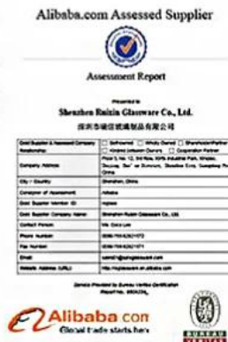
BV Verify factory