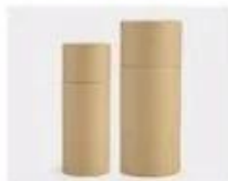
L. Paper Sleeve