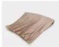
B. Corrugated paper