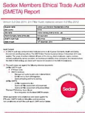
Sedex Verify factory certificate