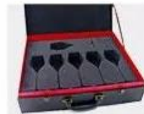
N. Gift Box