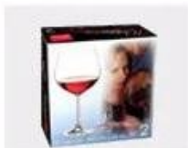
K. Color Box