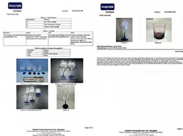
Spray glass cup dishwasher test report