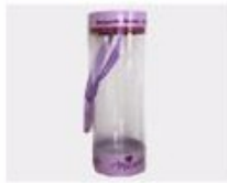
M. Pvc Box