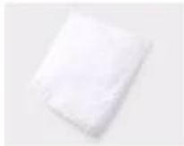
A. White paper