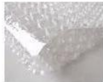
C. Bubble paper