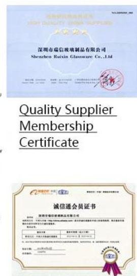
Alibaba TrustPass Membership Certificate