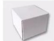
J. White Box