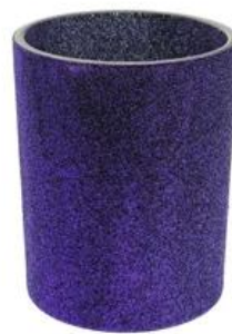
Purple Glitter Powder Glass Candle Holder