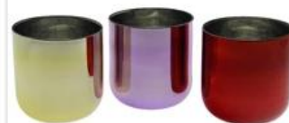
Plated and Painting Glass Candle Holder