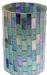
Mosaic Glass Candle Holder