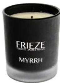
Black Frosted Glass Candle Holder