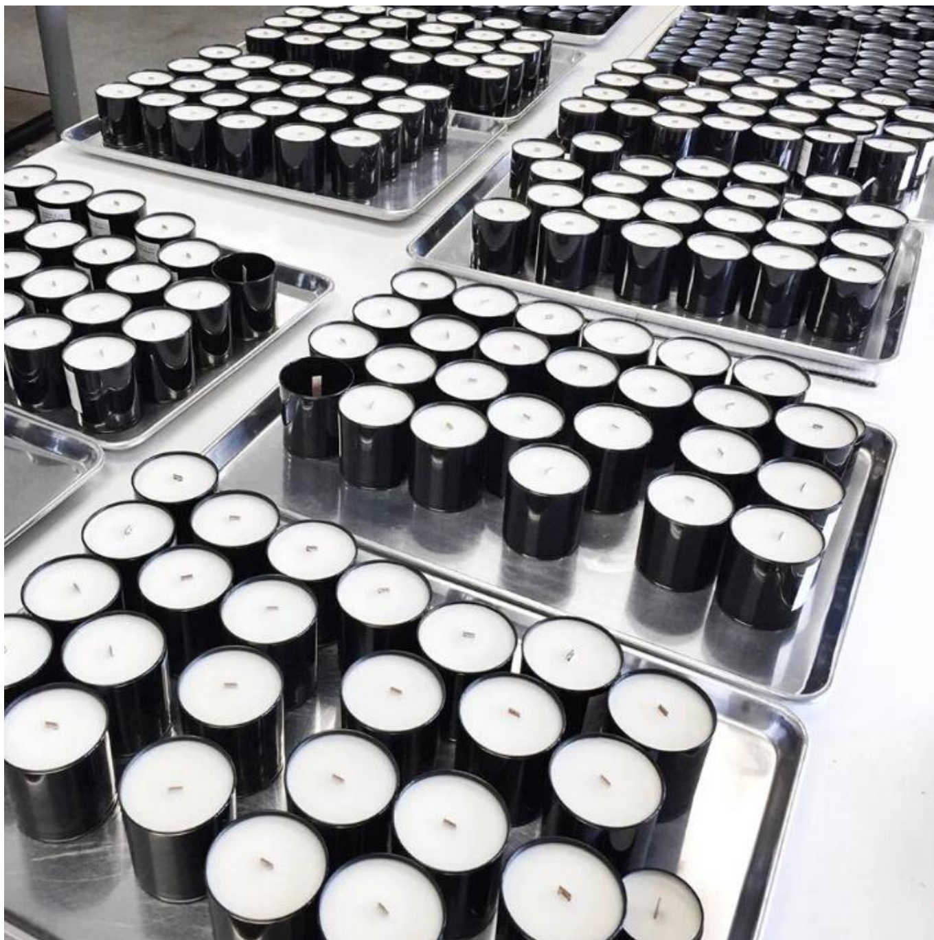
01 Wholesale Cheap Crystal Candle Holder,Gold Candle Holder,Decorating Glass Candle Holders Wedding