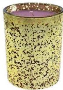
Hollow Golden Plated Glass Candle Holder