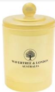
Glass Candle Jar