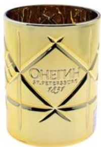
Golden Plated Glass Candle Holder