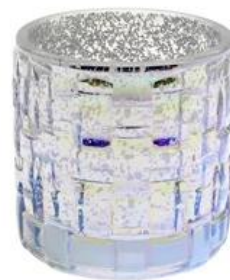
Glass Candle Holder with Hollow Plated and Colorful