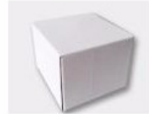
J. White Box