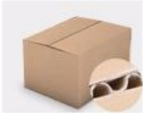
F. Three layer Corrugated paper master carton