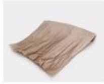
B. Corrugated paper