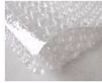
C. Bubble paper