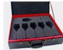
N. Gift Box