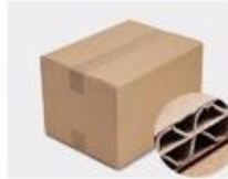
G. Five layer Corrugated paper master carton