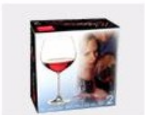
K. Color Box