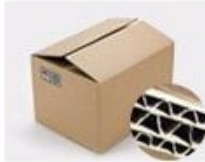
H. Seven layer Corrugated paper master carton