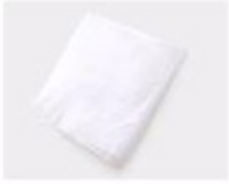
A. White paper