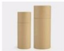
L. Paper Sleeve