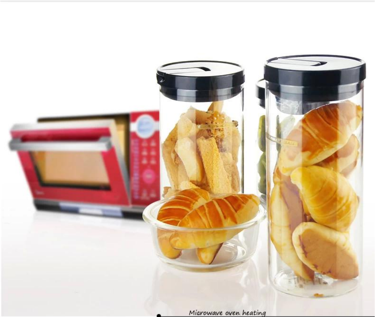
• Microwave oven heating