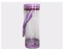
M. Pvc Box