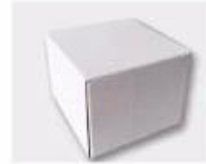
J. White Box